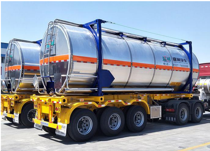
20 FT ISO Tank Container