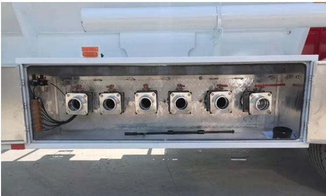
Aluminum alloy / Stainless steel valve