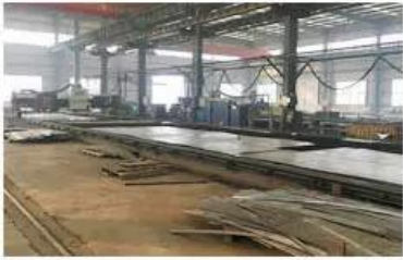
Laser cutting welding