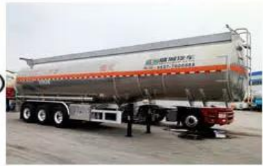
The whole trailer