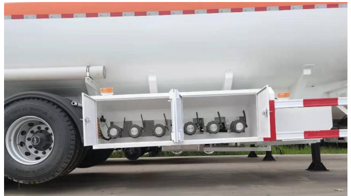
Euro Standard API Valve – Bottom loading and discharging