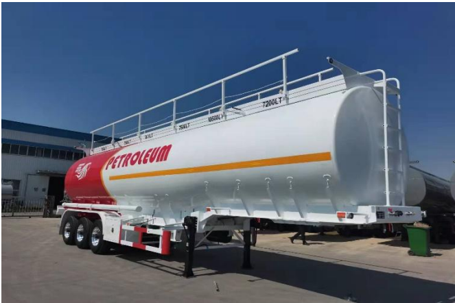
Gooseneck type frame – Low gravity center