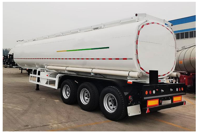
Straight Frame type – Stronger Structure of tank body & Chassis